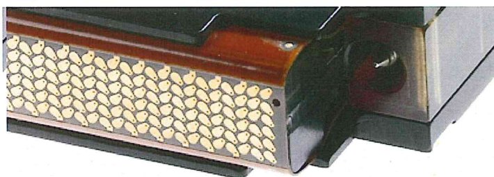
Flex Circuit with Ribbon Coax attached is integrated into a connector system. Clamping force is generated by jackscrews or pneumatic system.